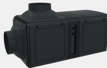
Water-cooled systems available. *Patent Pending

Wine Guardian Pro units come installed with service ports, appropriate pressure switches, and a refrigerant sight glass to allow for faster and more efficient maintenance .